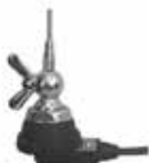
MA-1301 VHF, 5/8 \lambda , 140-174 MHz